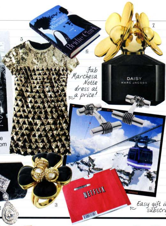
Fab Marchesa Notte dress at a price!